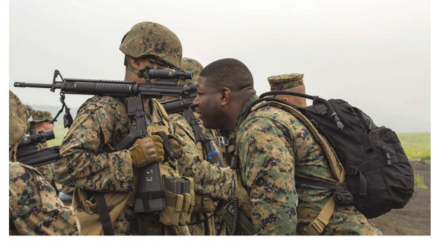
The SNCO's responsibility is at the tactical level.

Another illustration of this relationship was given to me by my first platoon sergeant. I stood in platoon formation as a private first class in "Echo 2/6" as the staff sergeant said, "This is a family. The lieutenant is your daddy and I am your mama." I initially shirked from the analogy that seemed contrary to my