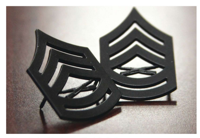
SNCOs are the translators from the officer to the Marine.

perception of an infantry unit leader. He went on to say: